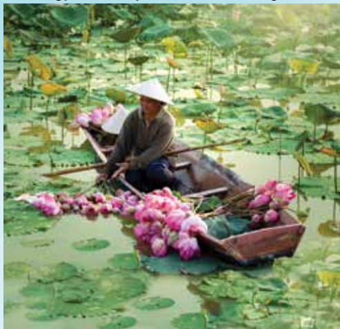
The lotus is one of Buddhism's most sacred flowers, blooming from muddy waters each morning.

Visit a local workshop which provides training for thousands of Cambodians to perpetuate the creation of their traditional, cultural handcrafts.