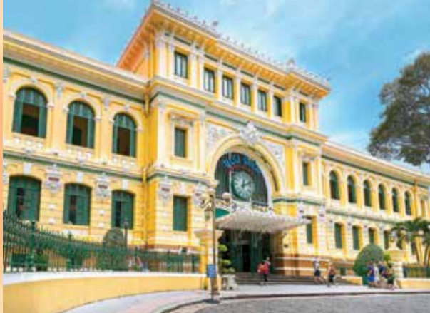
View Saigon's stunning, Neoclassical Central Post Office, built by Cochinchina's chief architect, Marie-Alfred Foulhoux, in 1891.

The astounding Banteay Srei Citadel of the Women is considered the ultimate expression of Khmer genius. Constructed in the 10 th century from rose-pink sandstone, the temple is believed to have been built by women based on the intricacy of the elaborate three-dimensional carvings and filigree relief work that adorn its peaked buildings.