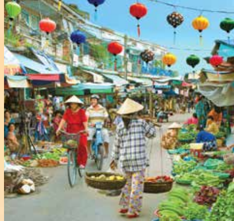
Experience Vietnam's kaleidoscopic markets, a vivid nexus of history, culture and commerce.