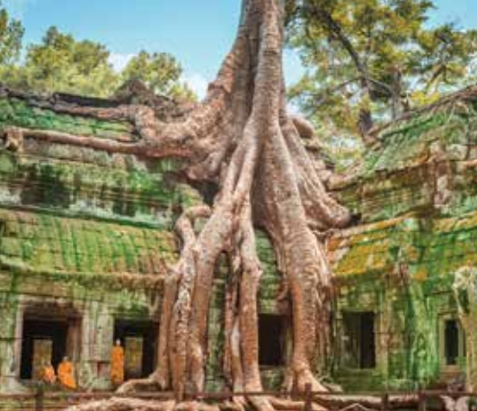
Roots cleave stones and lichen sprouts from delicately carved reliefs at the striking Angkor temple of Ta Prohm.

RESPONSIBILITY: Gohagan & Company, the sponsoring associations/ organizations, and its and their employees, shareholders, subsidiaries, affiliates, officers, directors or trustees, successors, and assigns (collectively "Gohagan"), do not own or operate any entity which is to or does provide goods or services for your program including, for example, lodging facilities, airline, vessel, or other transportation companies, guides or guide services, local ground operators, providers or organizers of optional excursions, food service or entertainment providers, etc. All such persons and entities are independent contractors. As a result, Gohagan is not liable for any negligent or willful act or failure to act of any such person or entity or of any other third party.