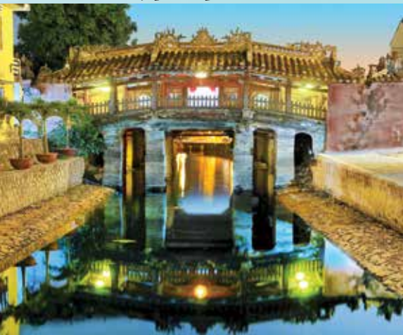
Admire the ornate, Lai Vien Kieu Bridge, built to link Hoi An's Chinese and Japanese quarters.

Near Siem Reap, the Temple of Angkor Wat is the largest religious structure in the world, built in the 12 th century by King Suryavarman II to honor the Hindu god Vishnu. Angkor Wat stands in testament to the centuries-long grandeur of the prosperous Khmer Empire.